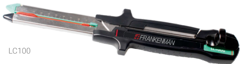
SIDE VIEW LC100

UNIQUE FIRING SAFETY LOCK TO PREVENT INADVERTENT PRE-FIRING DURING PREPARATION AND POSITIONING